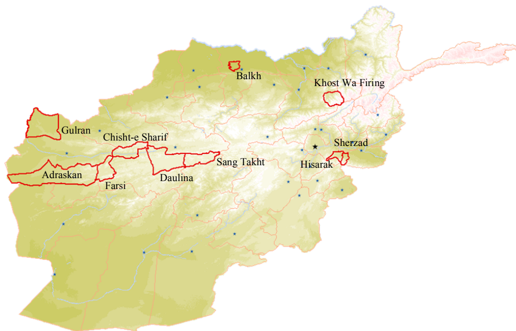
Figure 1. Ten Sample Districts